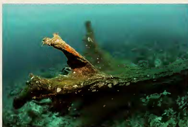
Figure 18. Tree trunk on reef at water depth of 18 m, Pulau Rondo, October 29, 2005.

On the east side of Pulau Rondo the shallow survey was dominated by rock (50% cover) with rubble representing 30% of the substrate and live coral cover only 17%. The deep survey was dominated by rubble (70% cover), with little live coral cover (18%). Tsunami damage was observed in this area; specifically overturned dead Acropora spp. tables and a large tree trunk (over 6 m in length) had been deposited on the reef between 15 m and 18 m water depth (Fig. 18).